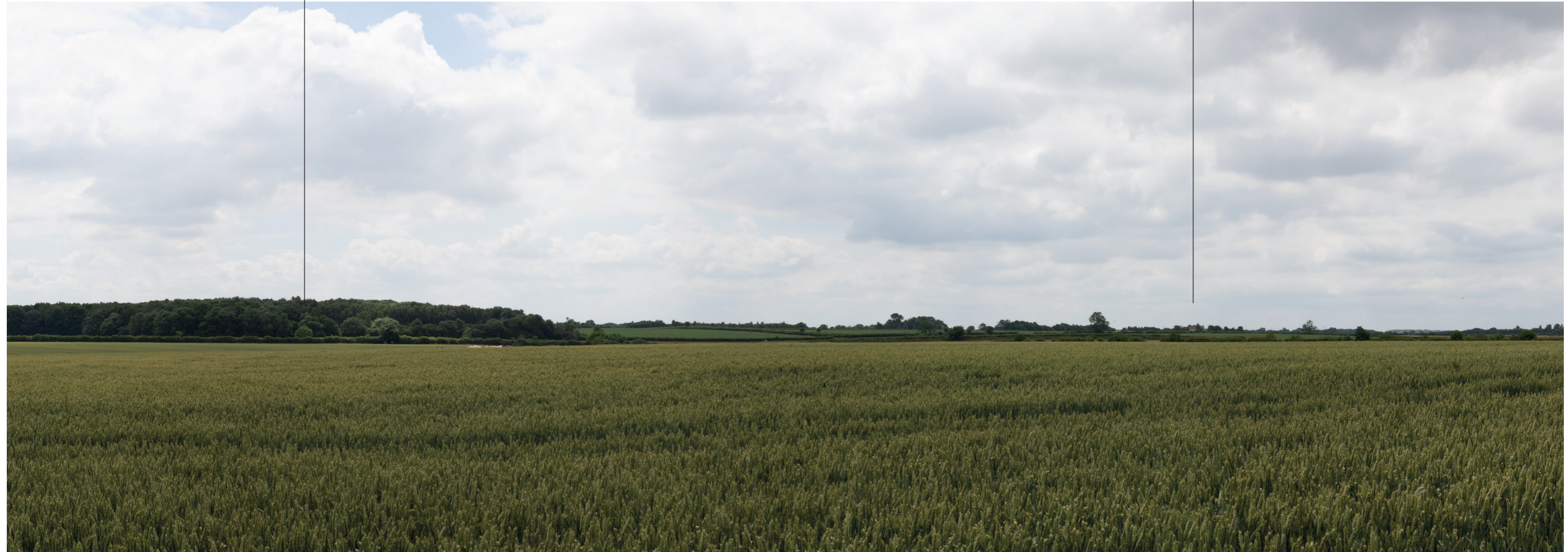
Representative Viewpoint 15 (Centre-right) - Rural lane to the south of Newell Wood

ISSUED BY Oxford t: 01865 887050 DATE Sep 2022 DRAWN VW PAGE SIZE 420mm x 297mm CHECKED RGF STATUS Final APPROVED RP/CG