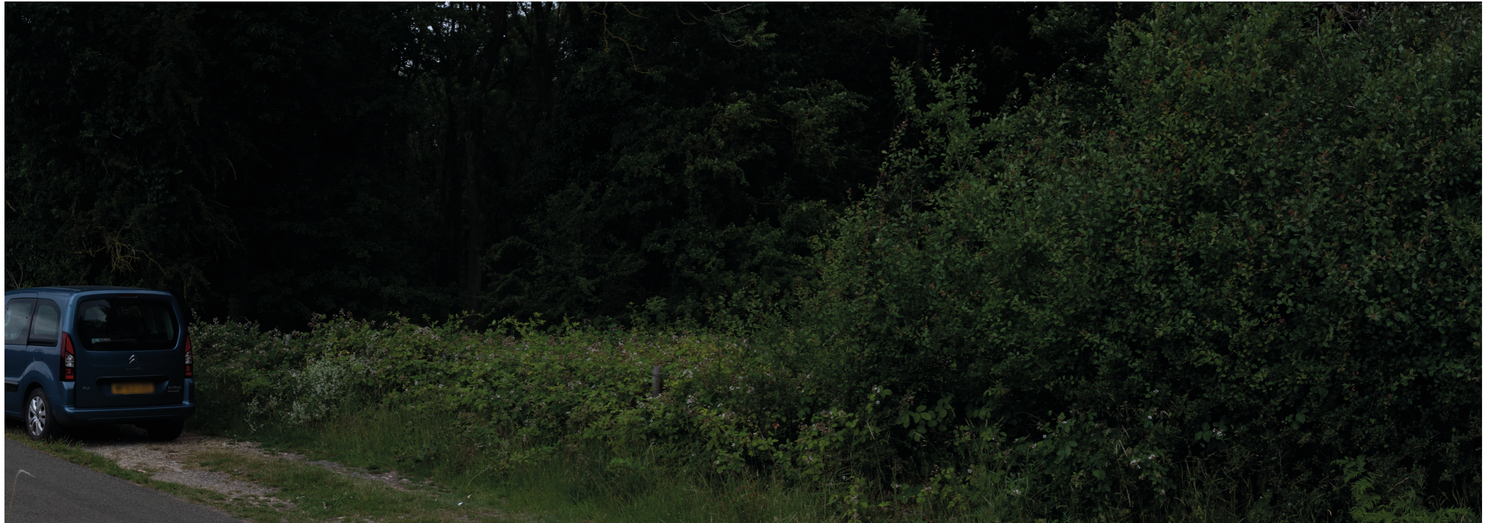
Representative Viewpoint 15 (Right) - Rural lane to the south of Newell Wood

Z:\7863_NSP_Solar_Farm_Confidential\docs\Visuals\LVA\Representative\7863_LVA_PP_015.indd